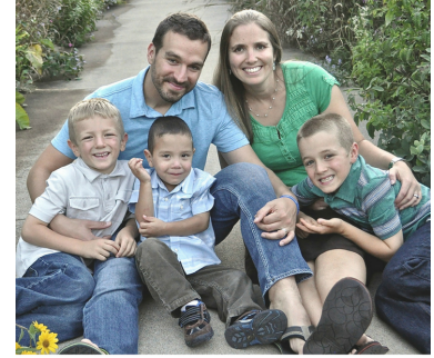
THE HAWLEY FAMILY