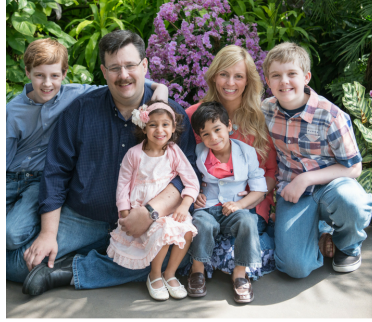
THE EPLION FAMILY