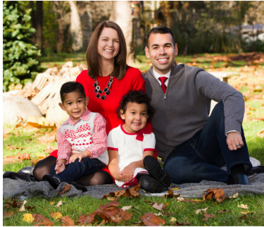
THE DIAZ FAMILY