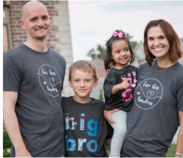
THE JONES FAMILY