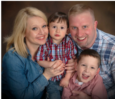
THE HUNCKLER FAMILY