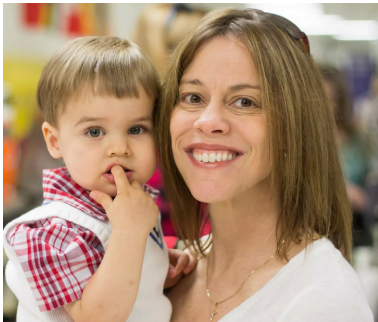
THE HELTON FAMILY