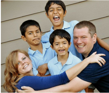
THE BRUVOLD FAMILY